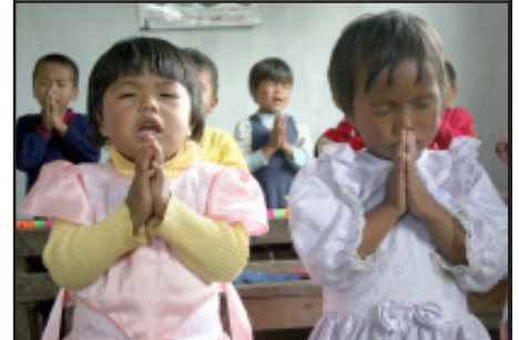
Students praying before meal at school

General Secretary UUNEI Financial Secretary UUNEI