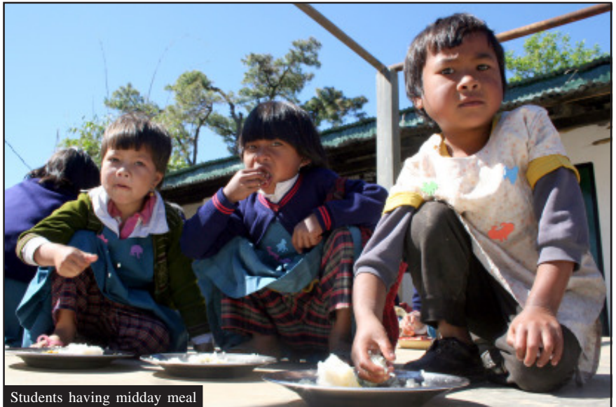
Students having midday meal